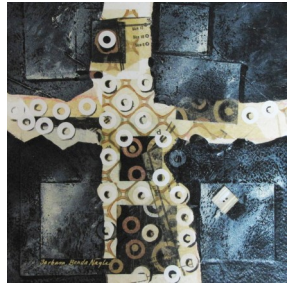
Barb Nagle's, "Square Peg"